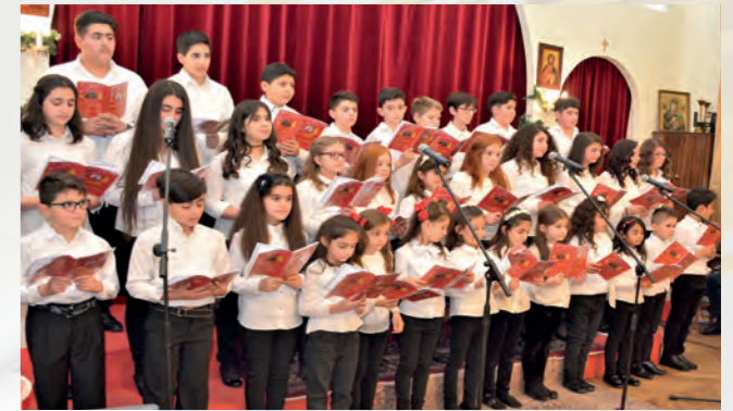
children's and youth choir